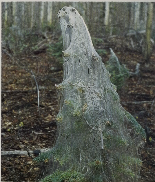
Figure 3. Tortrix webbing on white spruce understory.

Adults emerge from the rolled leaves and are active from late June until early July. Tortrix moths are mostly gray with some brown